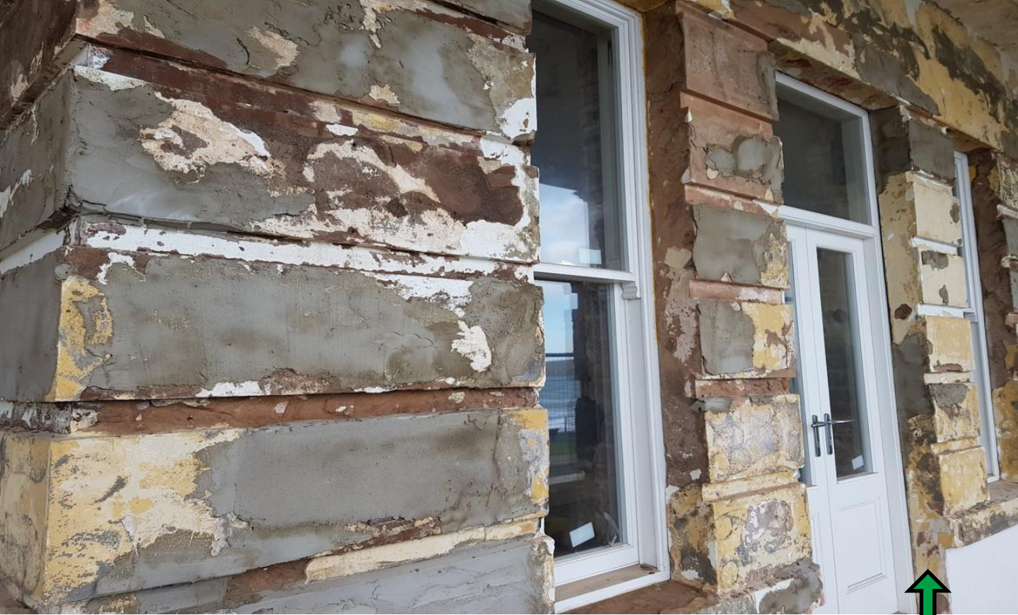
Stripped stucco render with repairs